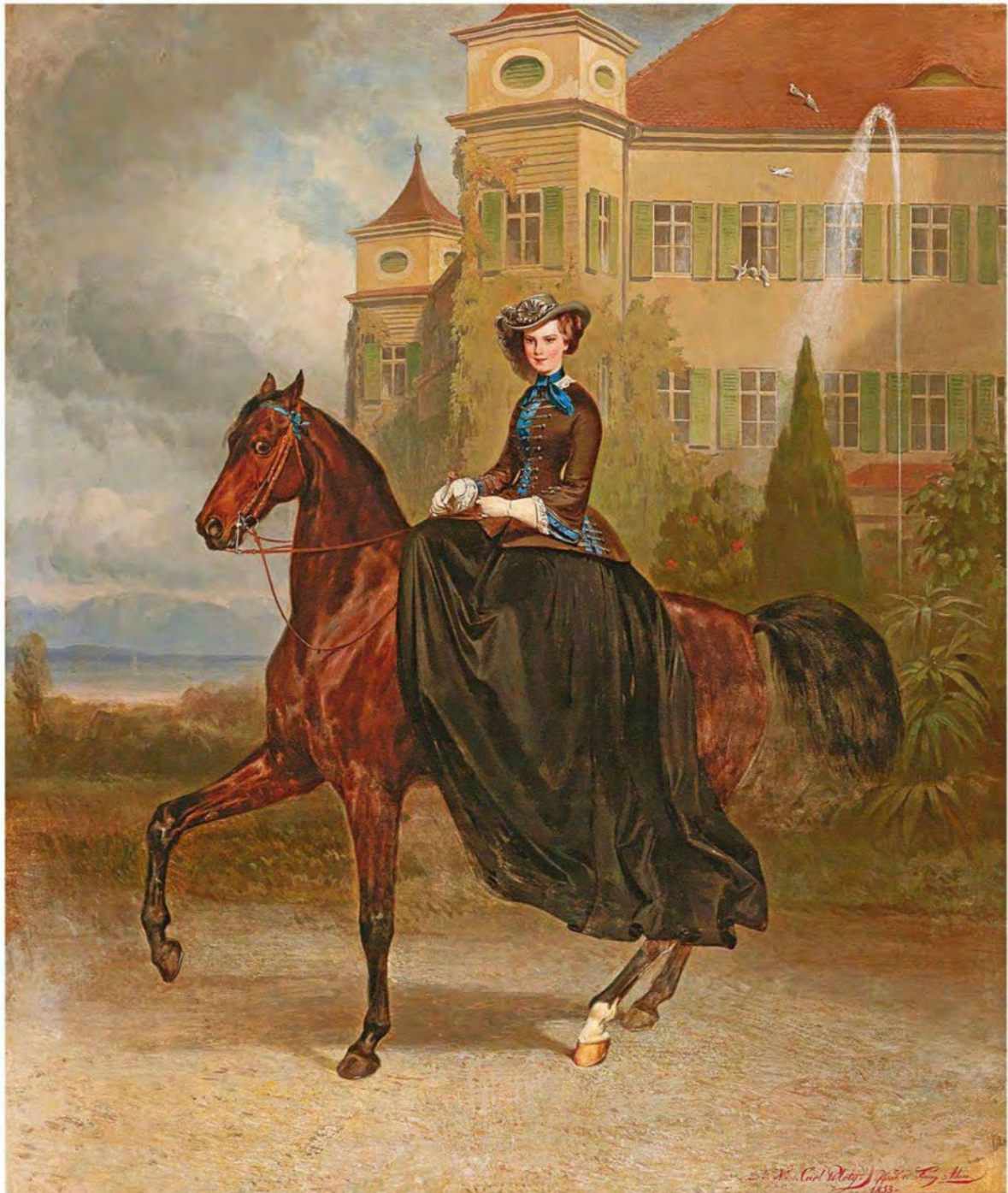
Empress Elisabeth of Austria as bride on horseback in Possenhofen, by Carl Theodor von Piloty (1826-1886) and Franz Adam (1815-1886), 1853, oil on canvas, 128 X 108 cm. Estimate: € 300,000 - € 400,000. Sold for €1,540,000 by Dorotheum on April 27 this year