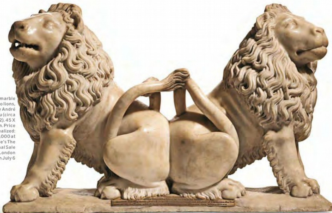
A carved marble group of two lions, 1364-1366, by André Beauneveu (circa 1335-1402). 45 X 29.2 X 12 cm. Price realized: £9,349,000 at Christie's The Exceptional Sale 2017, in London on July 6