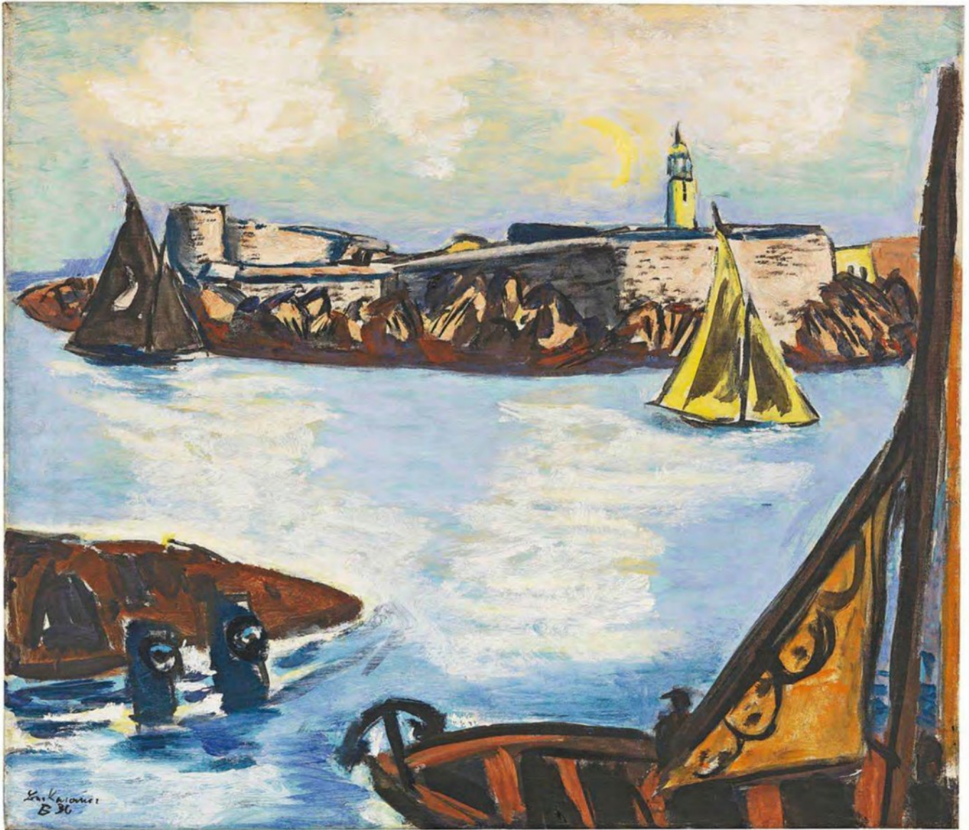
Château d'If , by Max Beckmann, 1936, oil on canvas, 65 x 75.5 cm. Estimate: € 800,000. Sold for € 1,687,500 by Ketterer Kunst on June 10, 2017, in Munich